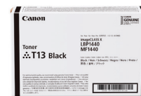
Toner T13 (Yield up to 10,600 Pages)

Canon eCarePAK Canon Extended Service Plans offer coverage beyond the standard one-year limited warranty 10 up to four years.