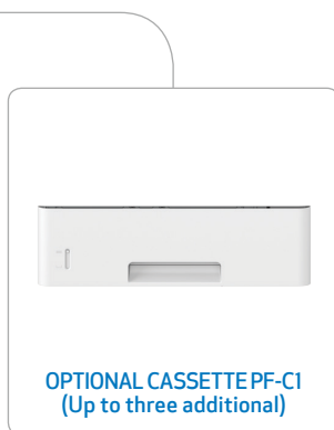
OPTIONAL CASSETTE PF-C1 (Up to three additional)