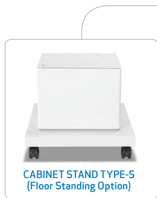
CABINET STAND TYPE-S (Floor Standing Option)

Canon eCarePAK Canon Extended Service Plans offer coverage beyond the standard one-year warranty 6 up to four years.