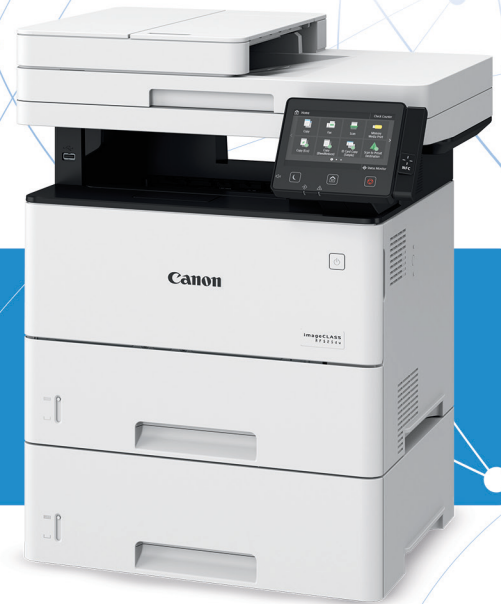
Shown with optional cassette.

Designed for small to mid-size workgroups within an enterprise environment, the imageCLASS MF525dw balances speedy performance, minimal maintenance, and the ability to expand paper capacity for busy groups. A 5" color touchscreen delivers an intuitive user experience and can be customized by a device administrator to simplify many daily tasks.