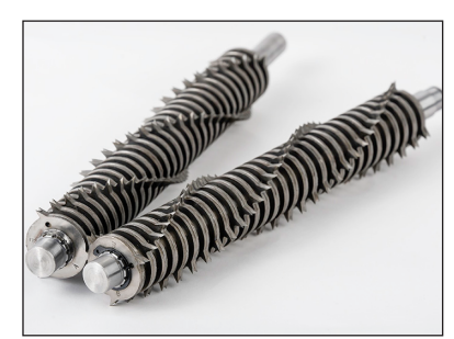
Aggressive cutting edges provide grip and superior shredding performance.