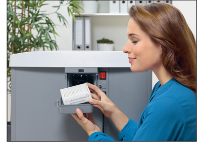
The CleanTEC<sup>®</sup> filter traps up to 98% of the fine dust and provides a healthier work environment.

This shredder automatically powers down after 30 minutes of inactivity. It will appeal to those interested in conserving energy as well as reducing electrical costs.